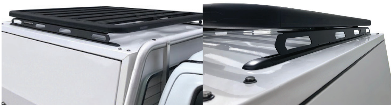
Ute fit - Spine fitted into track with TRIM HD bars